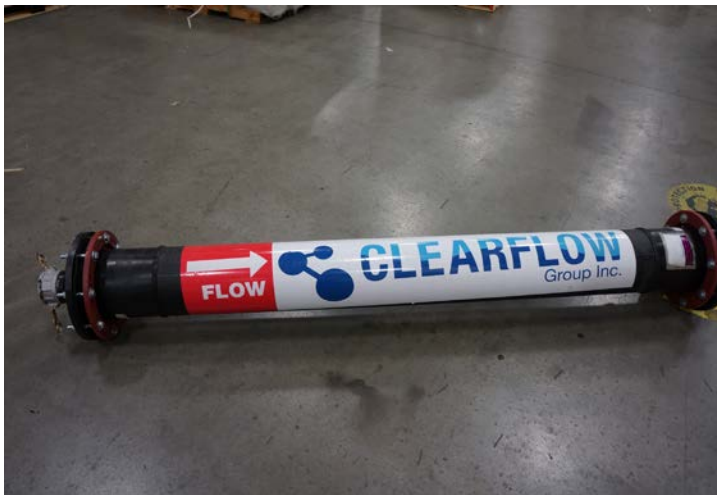
1: CLEARFLOW BAZOOKA