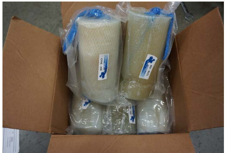
2: BAZOOKA LOAD