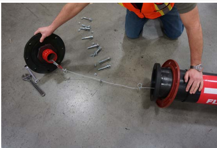
5: EXPOSE ENTIRE CABLE LENGTH