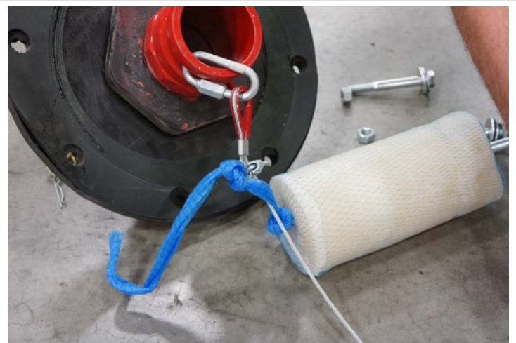
6: TIE WATER BLOCKS TO CABLE ATTACHMENT POINTS