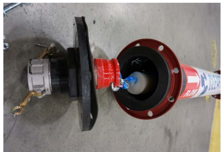
9b: INSERT CABLE W/ BLOCKS ATTACHED IN TO BAZOOKA