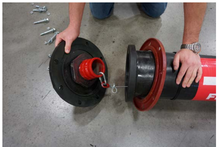
4: PULL OFF END FLANGE AND EXPOSE CABLE