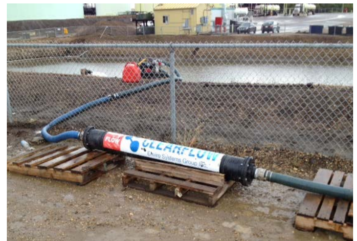
11: ATTACH HOSES AND PUMP

*NOTE: BAZOOKA LOADS TO BE ATTACHED AS FOLLOWS. 394: 4 X 394 AND 1 X 398. 398 TO BE ATTACHED LAST IN FLOW DIRECTION 494: 4 X 494 AND 1 X 360. 360 TO BE ATTACHED LAST IN FLOW DIRECTION