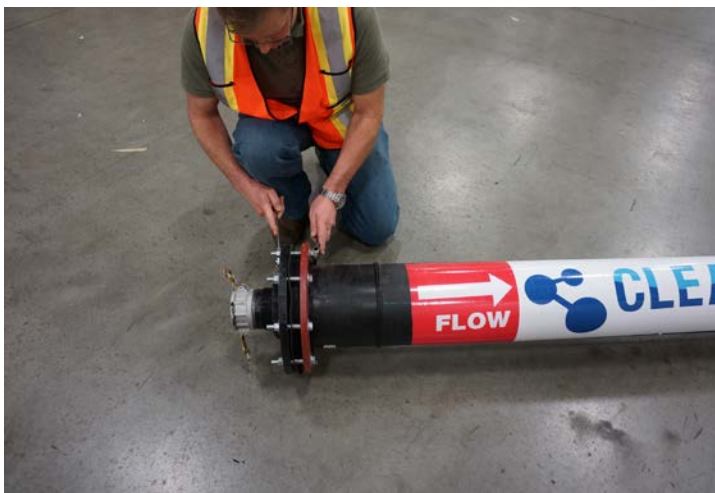
10: REATTACH END FLANGE TO BAZOOKA BODY