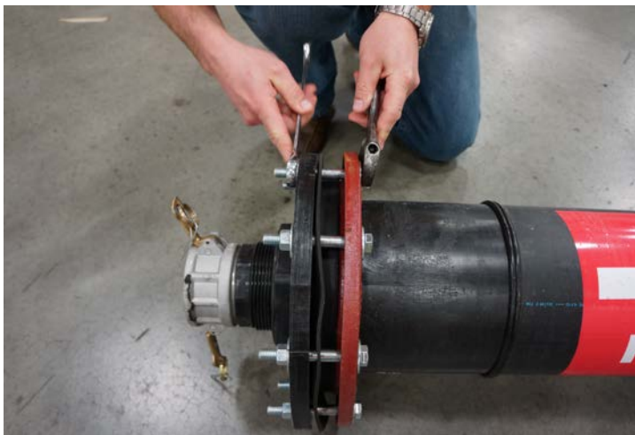
3: USE TWO \frac{3}{4} " WRENCHES TO REMOVE BOLTS OFF FLANGE