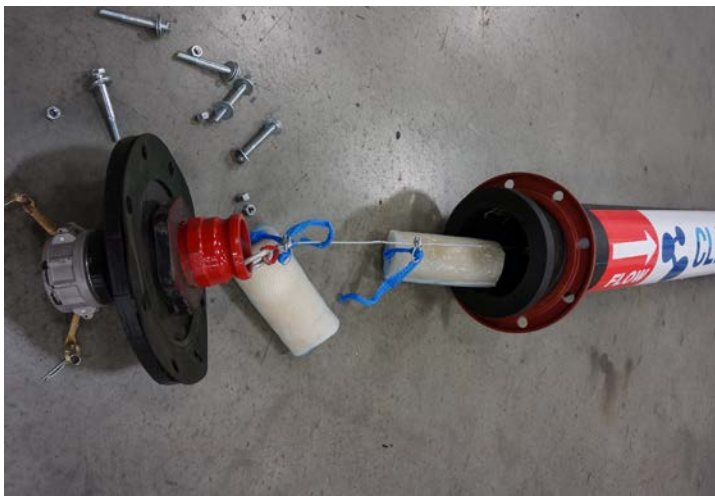
9a: INSERT CABLE W/ BLOCKS ATTACHED IN TO BAZOOKA