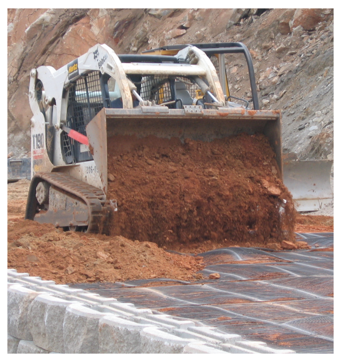
Tensar UX Geogrids install easily in stand alone applications as well as in conjunction with one of our proprietary soil stabilization systems.

For more information on Uniaxial Geogrids or other Tensar Systems, visit www.tensarcorp.com , call 800-TENSAR-1 , or e-mail info@tensarcorp.com .