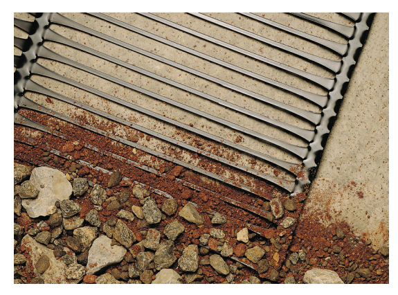
A high-density polyethylene, homogeneous product that does not require weaving, coating or welding to maintain the product's integrity.

Tensar® Uniaxial (UX) Geogrids are manufactured using select grades of high-density polyethylene (HDPE) resins that are highly oriented and resist elongation (creep) when subjected to high tensile loads for long periods of time. Geogrids manufactured from HDPE provide high resistance to installation damage and chemical or biological long-term degradation. In fact, Tensar UX Geogrids have shown no degradation after long term exposure to pH levels as high as 12 and can be used in both dry and wet-cast environments.