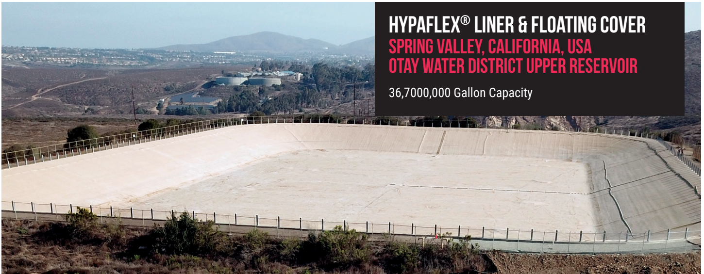
HYPAFLEX® LINER & FLOATING COVER SPRING VALLEY, CALIFORNIA, USA OTAY WATER DISTRICT UPPER RESERVOIR 36,700,000 Gallon Capacity